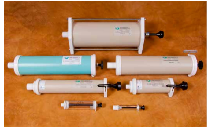
Volume Calibration Syringes